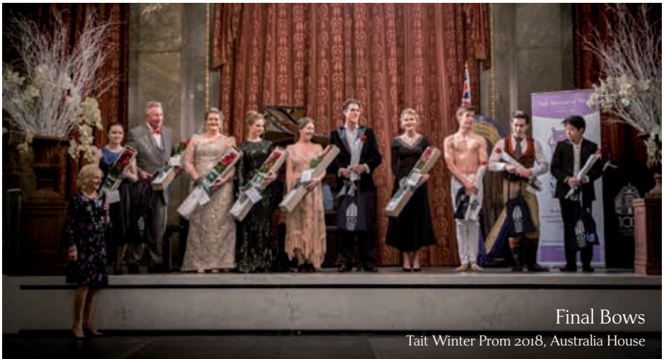
Final Bows Tait Winter Prom 2018, Australia House